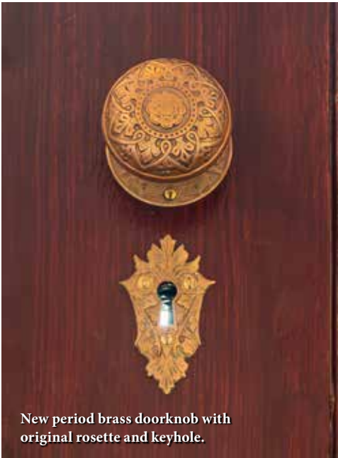
New period brass doorknob with original rosette and keyhole.