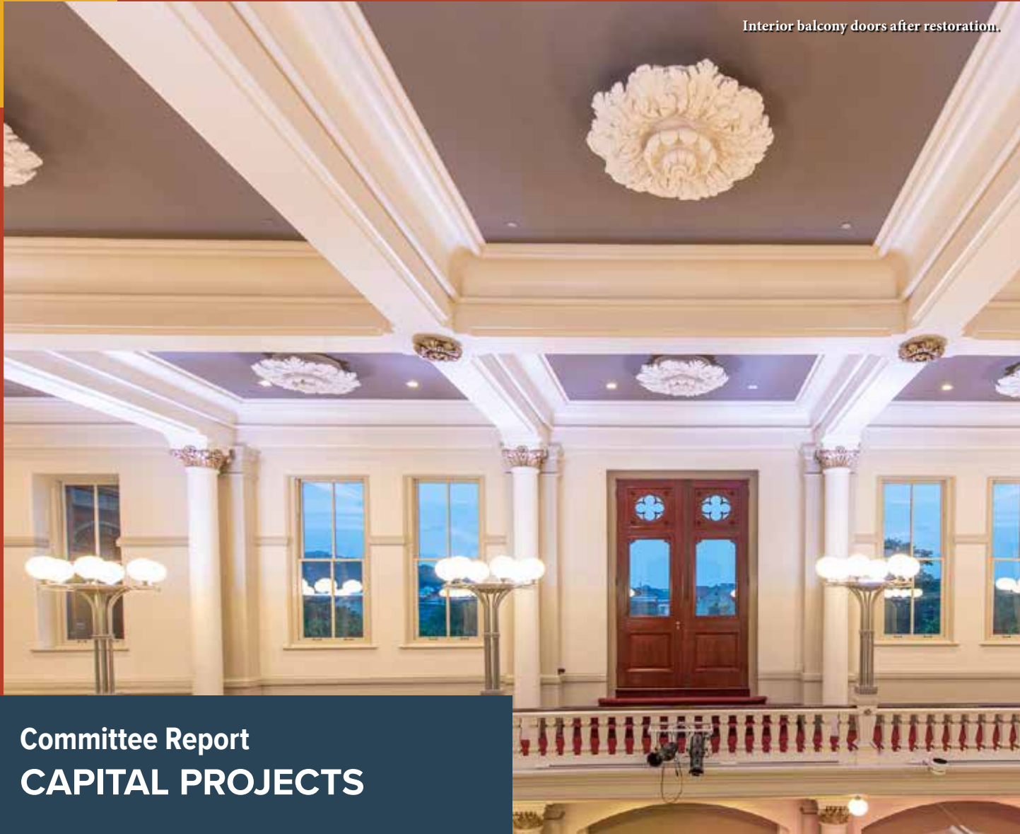
Interior balcony doors after restoration.