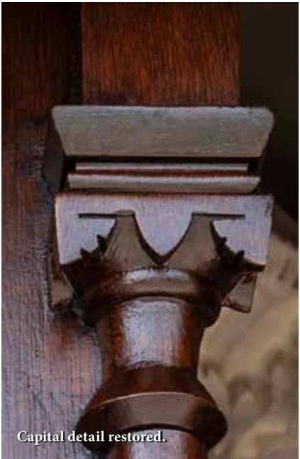
Capital detail restored.

Discover more in the FMH website Blog: Restoration of Music Hall's Balcony Doors: Craft, Industry, and Immigration Revealed .