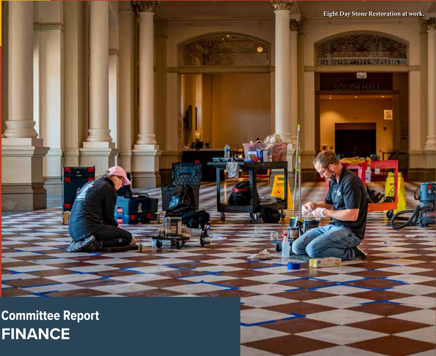
Eight Day Stone Restoration at work.