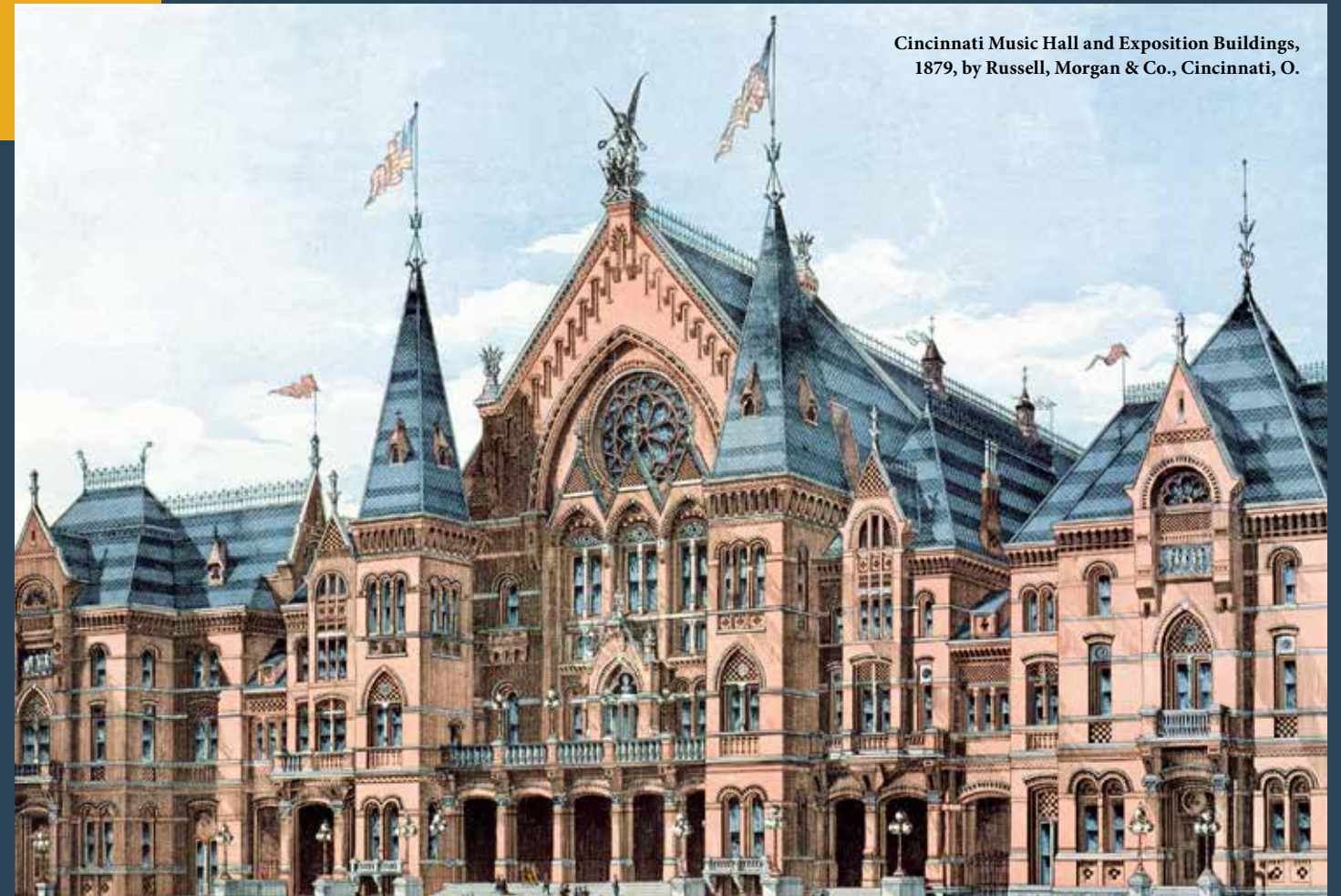
Cincinnati Music Hall and Exposition Buildings, 1879, by Russell, Morgan & Co., Cincinnati, O.