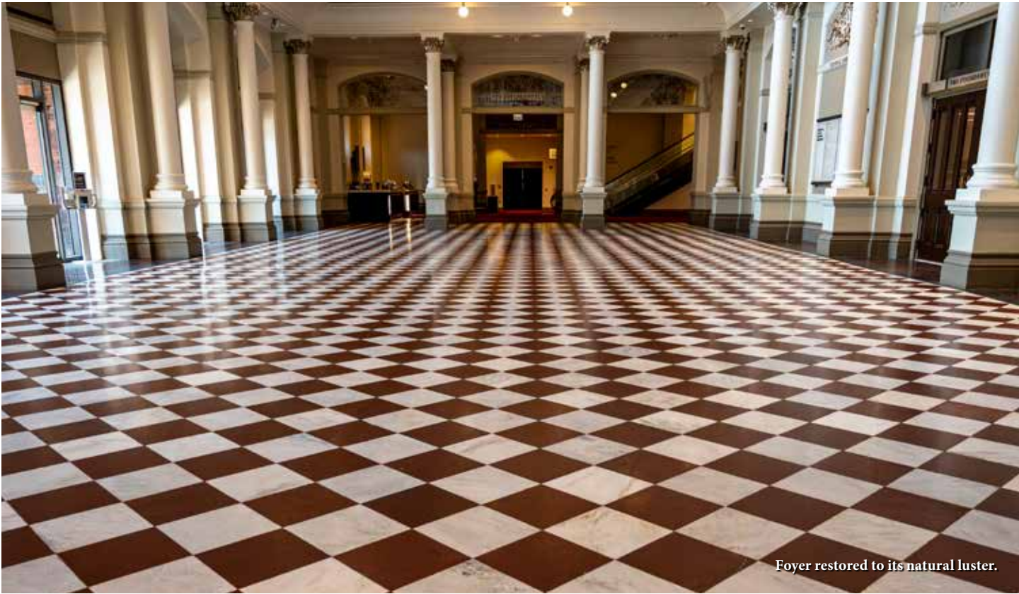
Foyer restored to its natural luster.