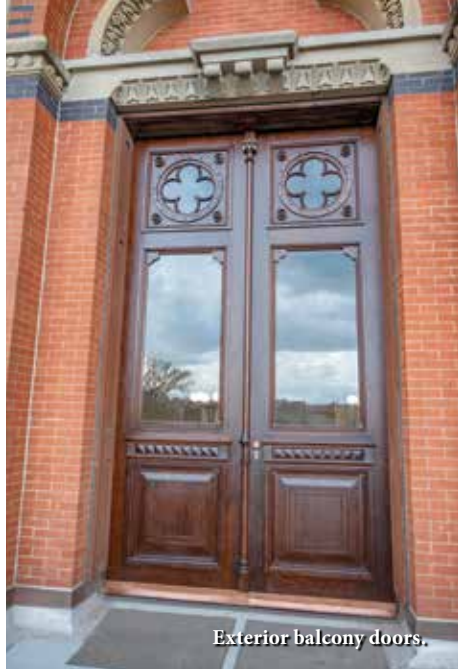
Exterior balcony doors.

In early 2025 Architectural Reclamation, historic preservation and restoration specialist, removed the 13-foot-tall double doors on the second-floor balcony level and worked on them in their workshop in Franklin, Ohio. The work on them included the woodcrafting of missing architectural trim and details. Reinstalled in June 2025, the final application of the faux-graining interior finish was completed, matching the 1878 interior doors, balustrades, and grand staircases. The door's exterior wood casing was completed just after the herald trumpeters' annual fanfare opening the May Festival from the balcony.