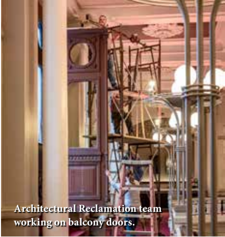
Architectural Reclamation team working on balcony doors.

FMH’s investment portfolios are managed in accordance with FMH’s Investment Policy, the primary goal of which is to grow and maintain the purchasing power of the portfolio. Typically, 70-85% is invested in high quality equity securities, with the balance allocated to fixed income, private credit and preferred securities. Bahl & Gaynor Investment Advisors serve as FMH’s investment portfolio manager. To preserve investment balances for future use,