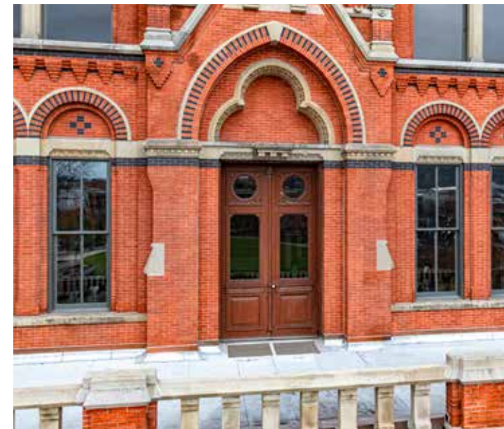
Balcony doors to be restored in 2024.

In November, Architectural Reclamation (Franklin, OH), historic structure preservation and restoration specialists, will remove and restore for the first time since 1878 the 12-foot-tall wooden second-floor balcony doors above Music Hall's main entrance. You may have noticed the Cincinnati Symphony's herald trumpet players entering and exiting these doors before the opening of the May Festival. The exterior of the doors is highly weathered, with "alligatoring" paint that allows the elements to soak into the wood, causing damage and the loss of portions of original decorative molding. Between 1969 and 1975, during the first redecoration and rehabilitation of the hall, the doors' interior decorative moldings were removed and