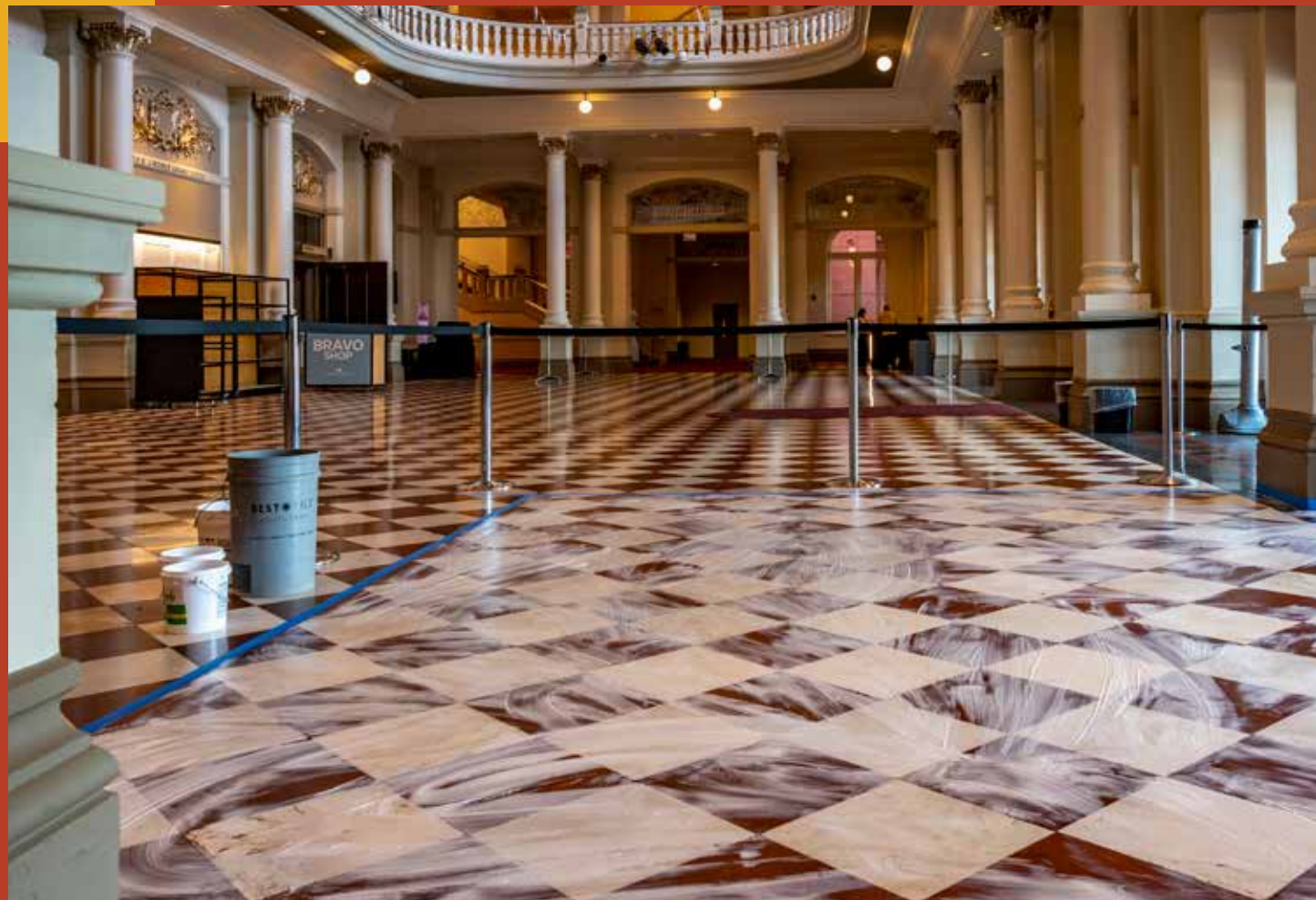
When this publication went to print, a deep cleaning of the first section of tile.