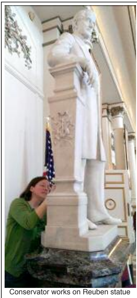
Conservator works on Reuben statue