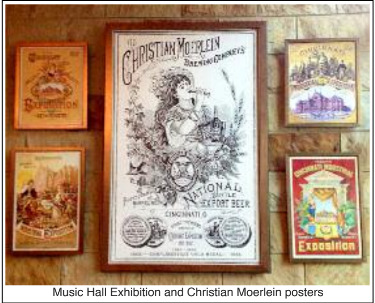
Music Hall Exhibition and Christian Moerlein posters

the 35,000 of all generations who came to LumenoCity and to the many festivals in Washington Park.