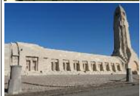
French National Cemetery & Ossuary – Verdun