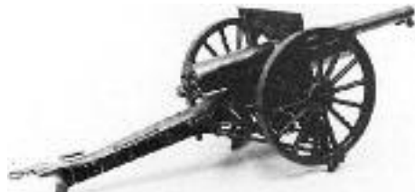
French 75mm Field Gun