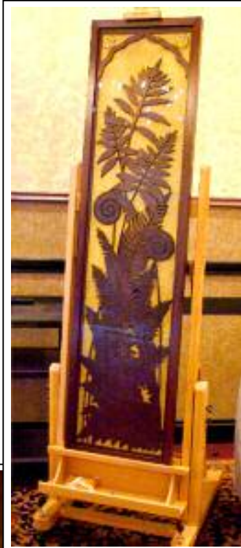
Cherry carved 'Garden Panel' from the 1878 Music Hall organ