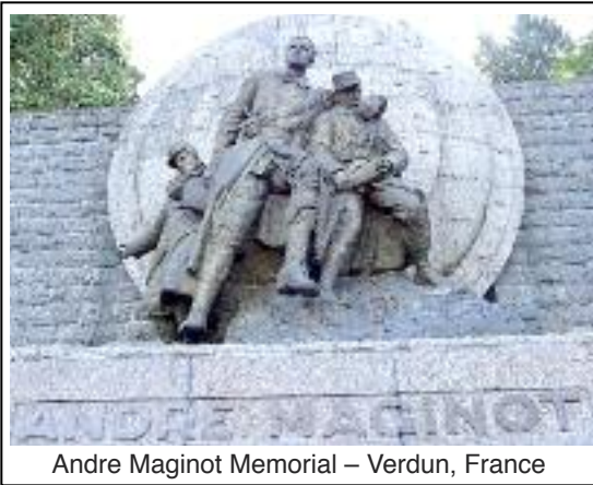
Andre Maginot Memorial – Verdun, France

In 1918 Music Hall was one of the first and foremost venues in the entire U.S. to commemorate the heroism and sacrifice of the service men and women of the First World War. The Great War ended on November 11, 1918 and the December 14, 1918 issue of the Cincinnati Enquirer reported that "The largest,