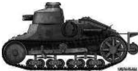
French Whippet Tank