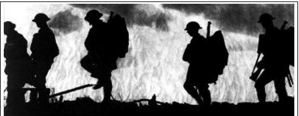
Soldiers of the Great War