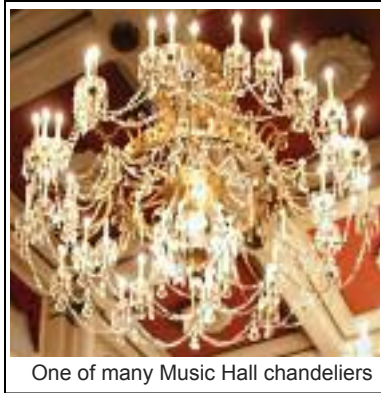
One of many Music Hall chandeliers

Do you love historic architecture? Are you pining to learn more about Cincinnati's rich choral traditions? Are you dying for a great ghost story? Do the mysterious machinations of "back stage" fascinate you? Well, there is something for everyone when you and your group take a private tour of Cincinnati's historic Music Hall in Over-the-Rhine.