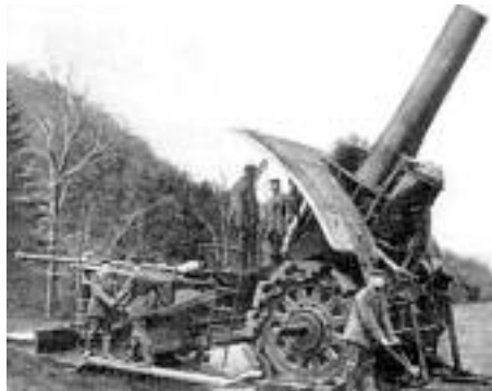
Big Bertha 210mm German Field Gun