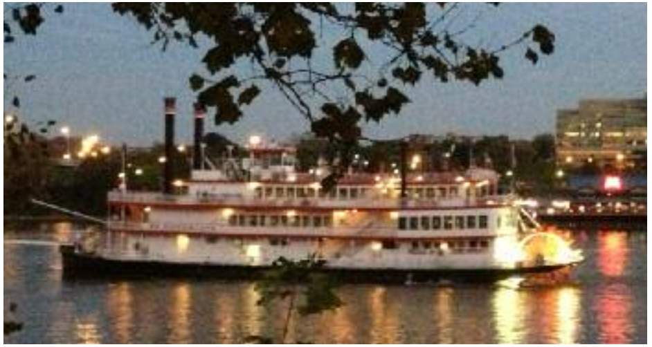
River view from The Banks