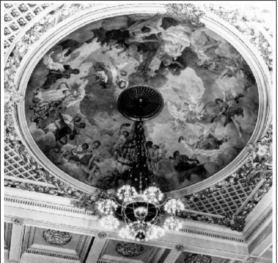
Allegory of the Arts