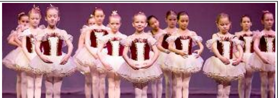
Cincinnati Ballet Otto M. Budig Academy, Children's Division

Cincinnati Ballet Academy offers a comprehensive dance education through three programs: Children's Division, Main Division and Adult Division as well as five different summer programs. The curriculum is Vaganova-based and infused with various 20th and 21st century influences that have developed over the past 60 years in classical ballet. The primary goal at Cincinnati Ballet Academy is to provide excellence in technical and artistic training and to inspire a love of dance.